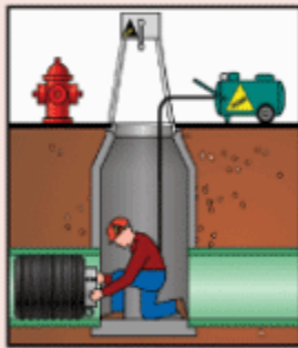
1) Install plug to isolate manhole