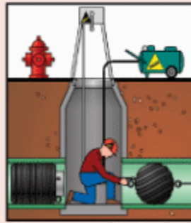
2) Attach Jet-Ball® to tag line and inflate